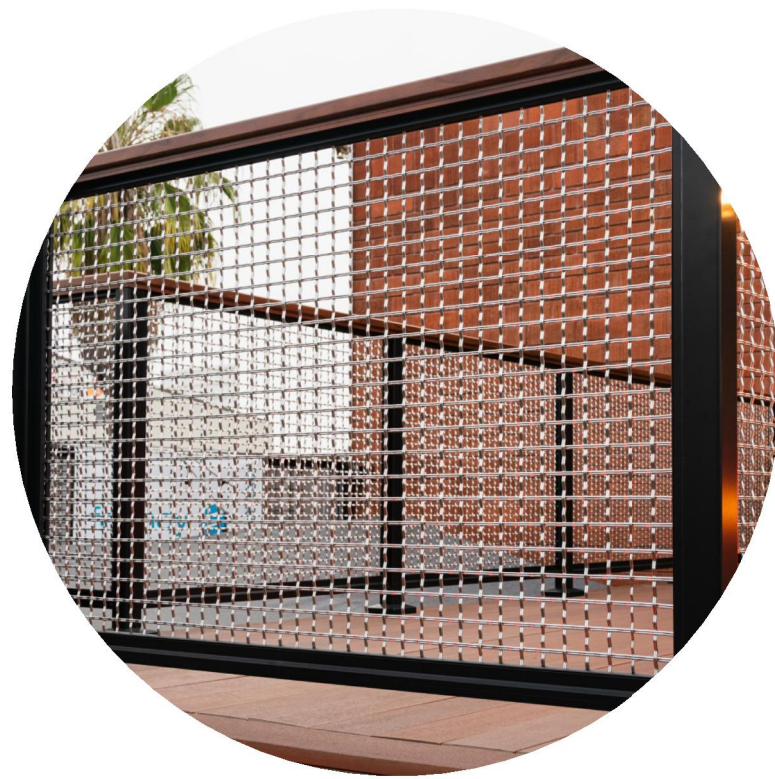
6 RAILING METAL INFILL