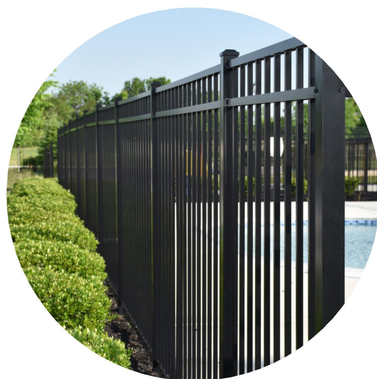
8 WOOD-LIKE ALUMINUM FENCE (6FT HEIGHT)