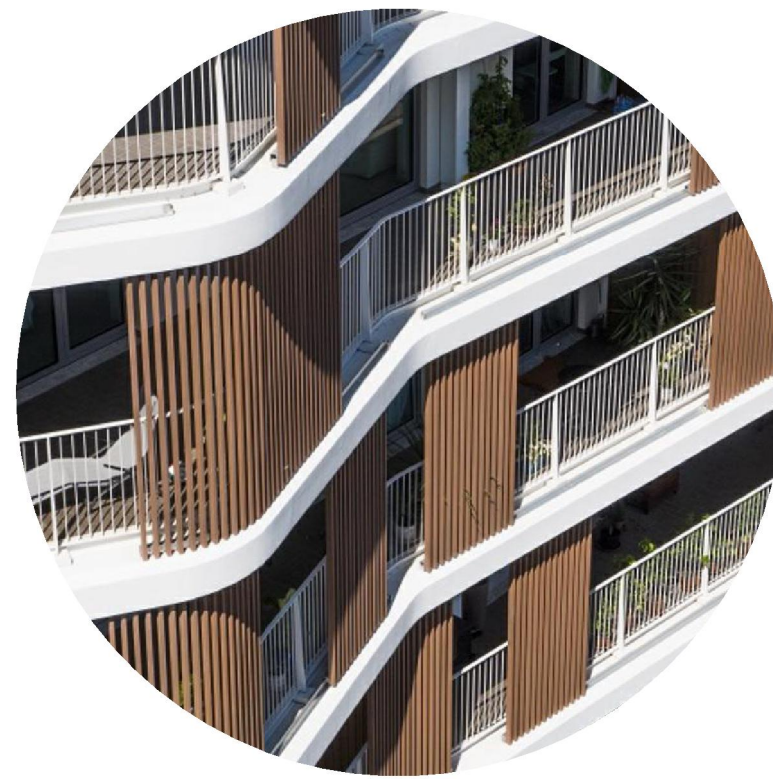
5 WOOD-LIKE ALUMINUM PANELS