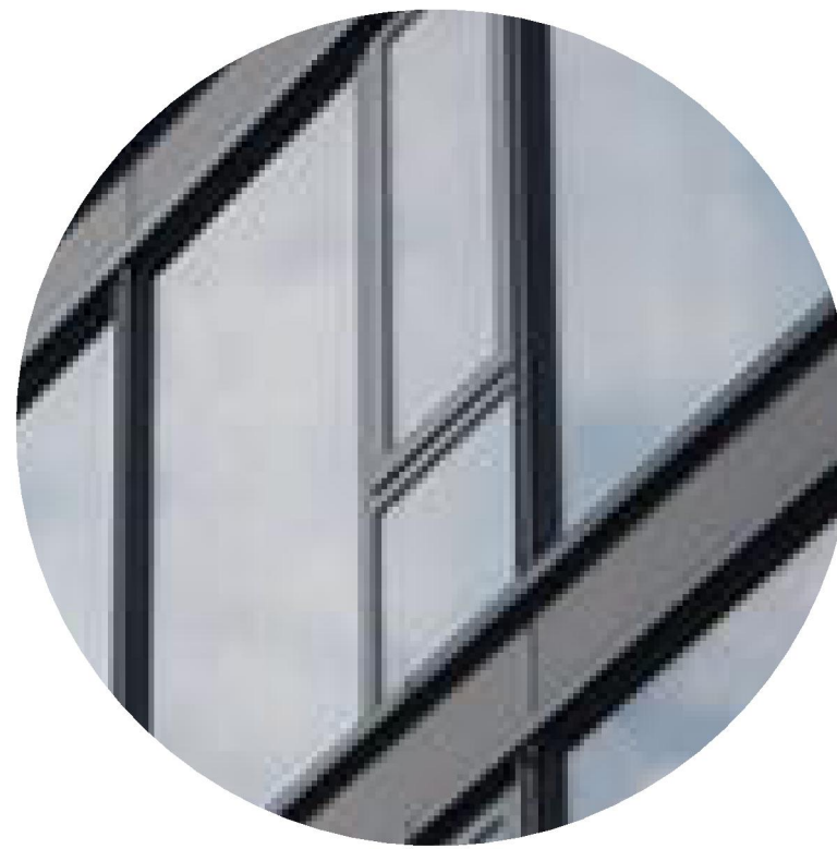
4 TINTED GLASS FOR STOREFRONT / WINDOWS / BALCONY DOORS VIRACON OPTIGRAY