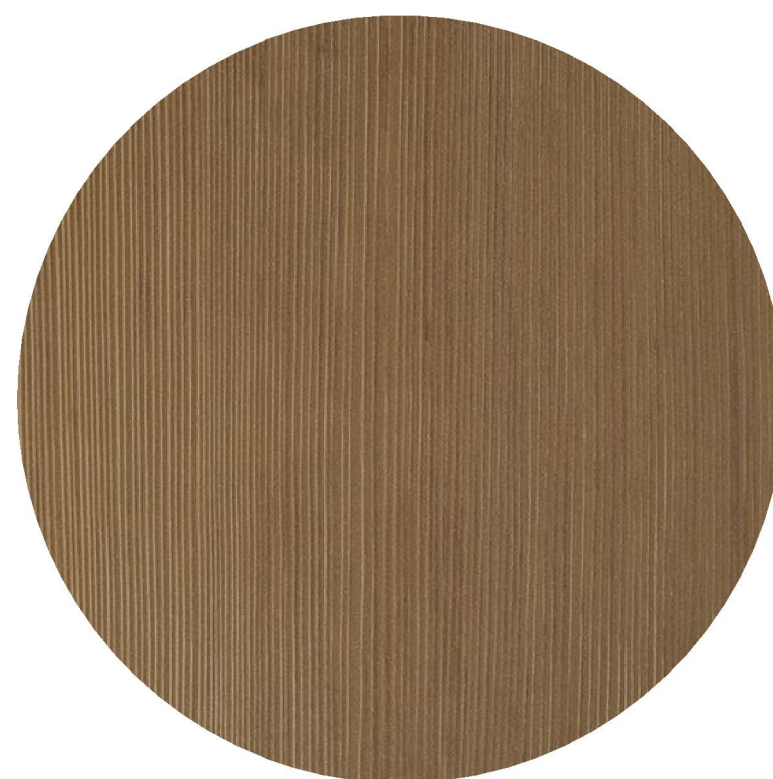
7 WOOD PANEL NICHHA RIFTSAWN CHESTNUT