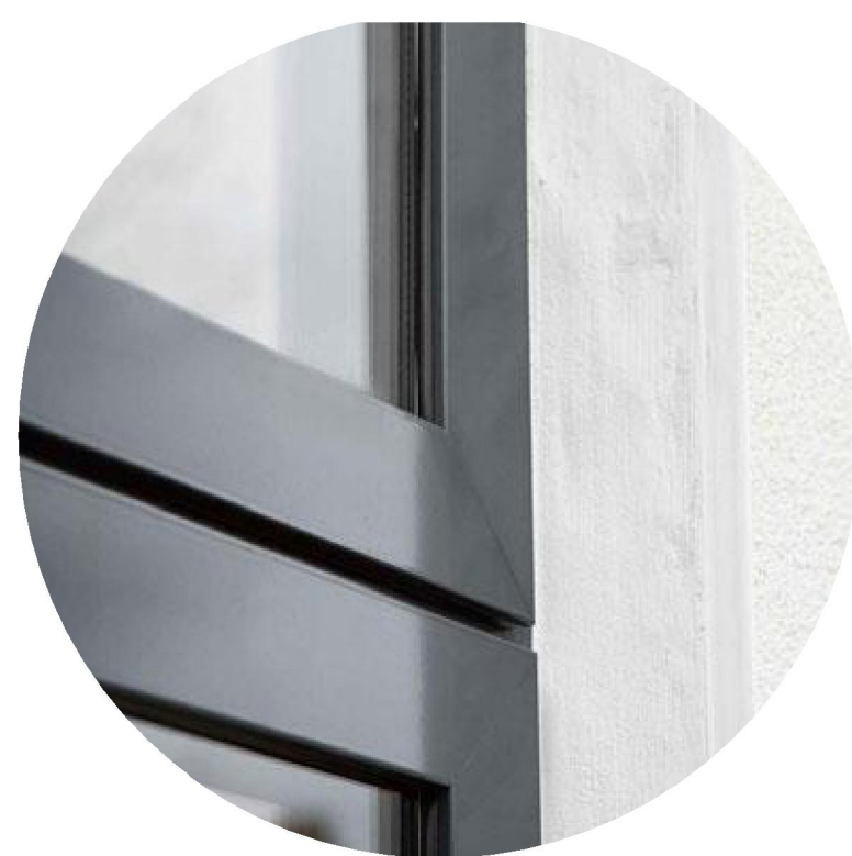
3 ALUMINUM FRAME 2134-30 IRON MOUNTAIN BENJAMIN MOORE / OR EQUIVALENT APPROVED BY ARCHITECT